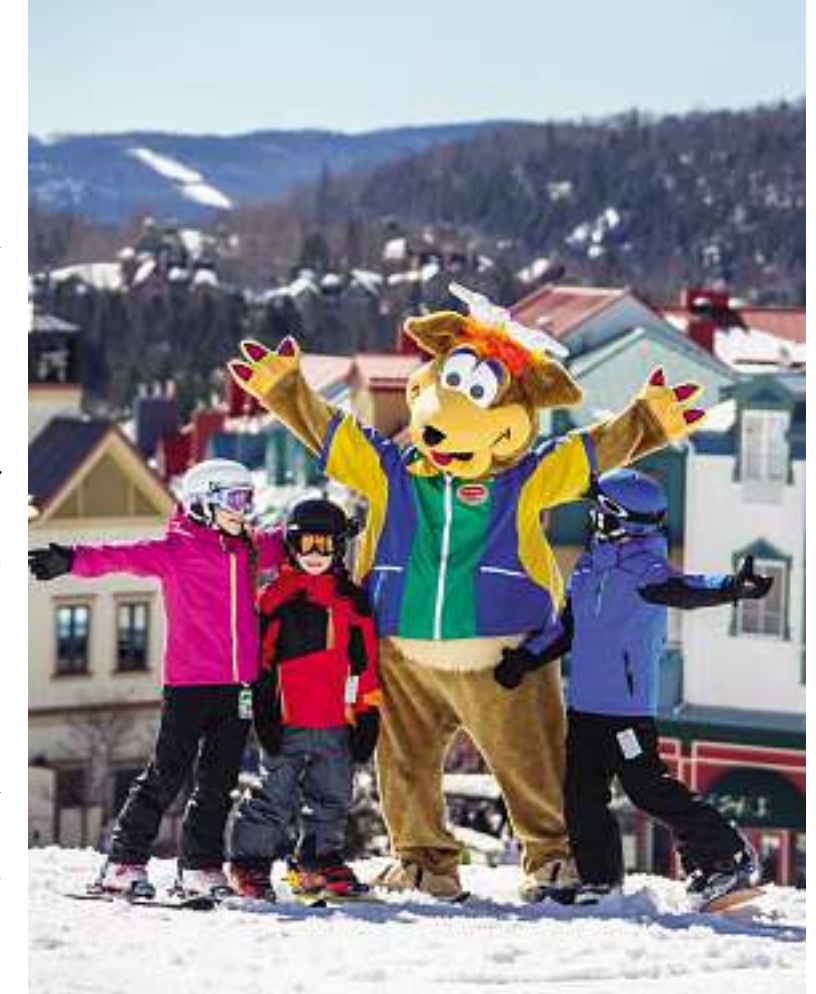
Tremblant's resort village hosts free entertainment for children, including visits with mascot Toufou.