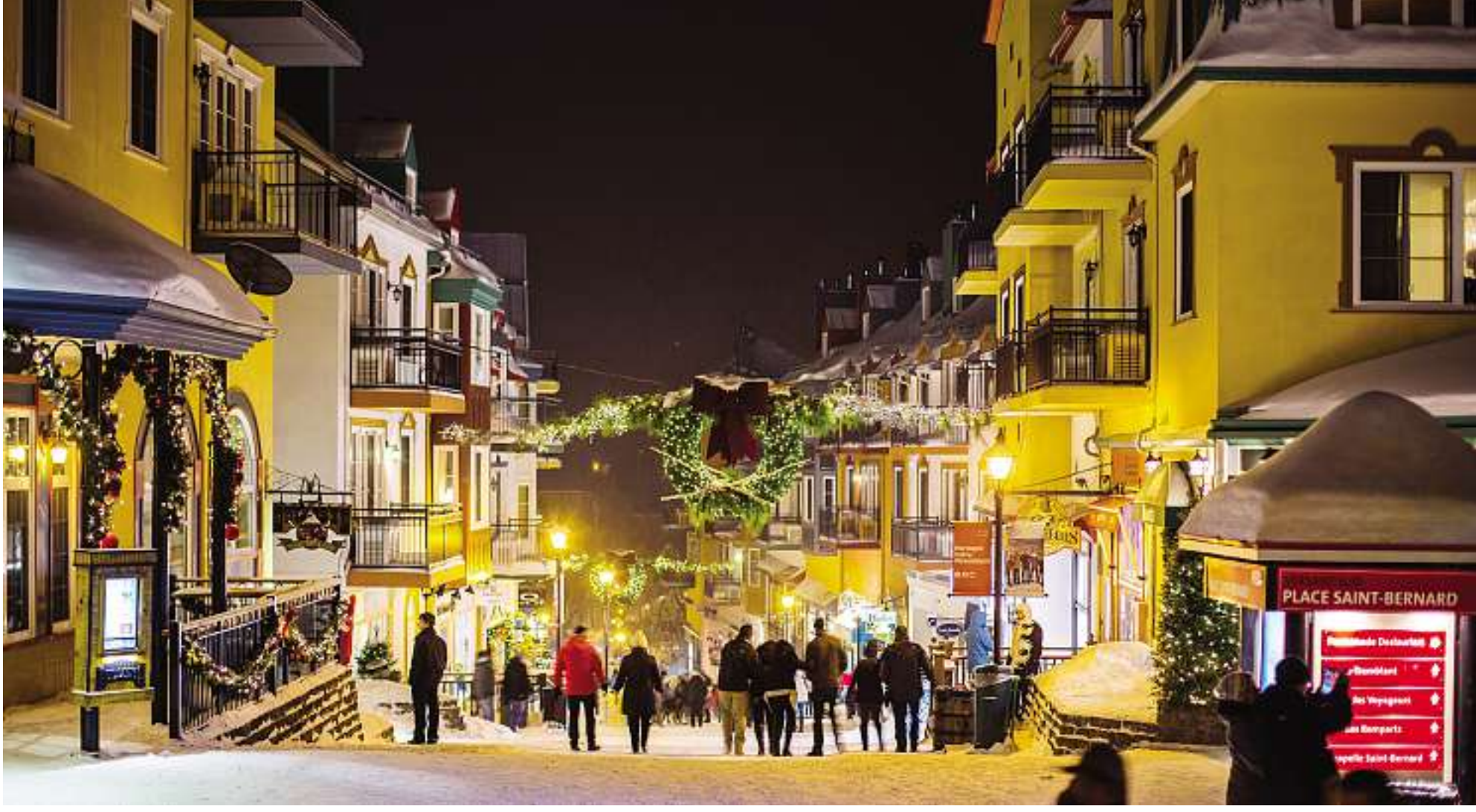
The slopeside pedestrian village at Tremblant is home to scores of shops, restaurants and hotels, providing ample après-ski activities. PHOTOS: TREMBLANT